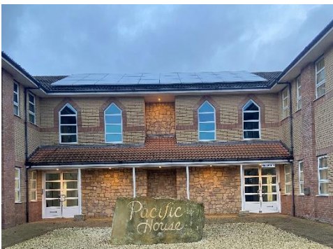
Pacific House, Carlisle