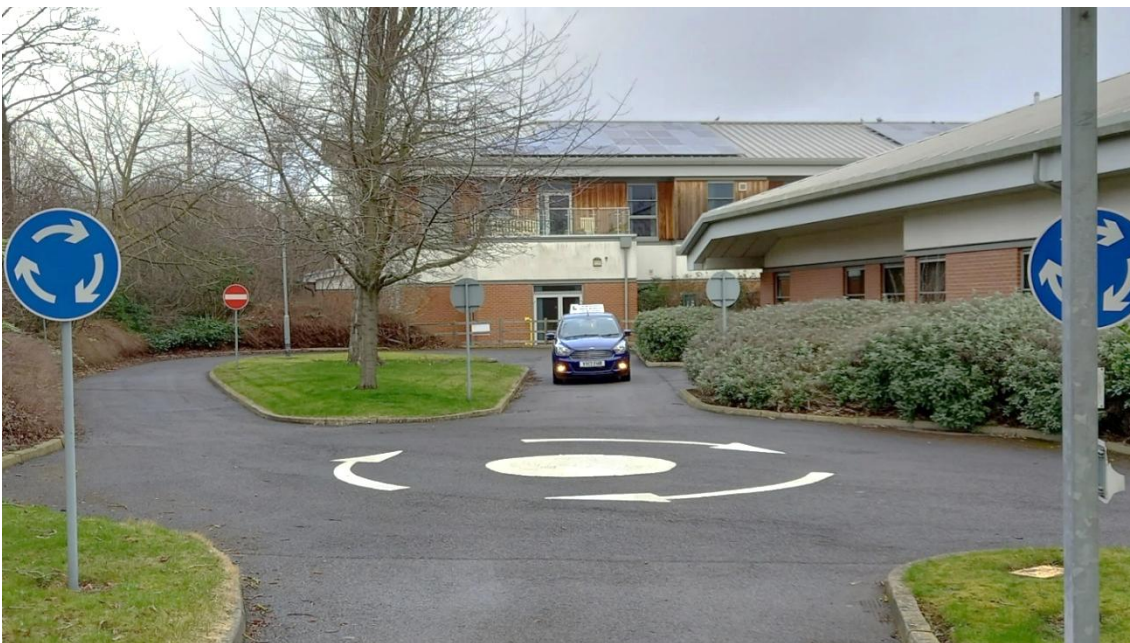
Driving track at Walkergate Park, Newcastle

All our vehicles have two sets of controls and are fully insured.