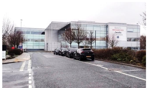
Phoenix House, Stockton