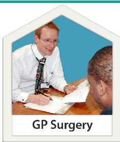
Annual health checks with your GP