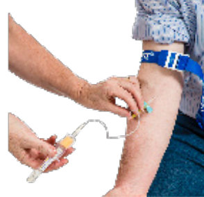
Help with taking your bloods.