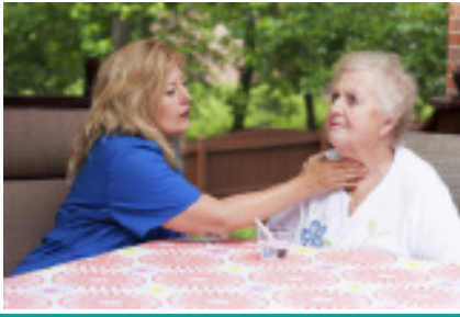
Dysphagia - eating and drinking problems