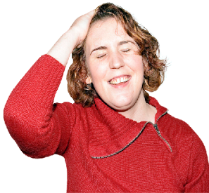
Problems with your memory. For example, forgetting things or people important to you.