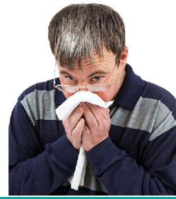
When you become poorly.