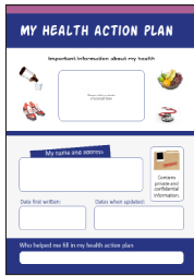
Health action plans