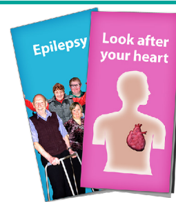
Coming to healthy living groups