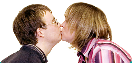
Sexual health and relationships