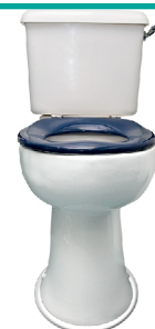
Continence problems - going to the toilet