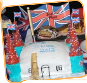
2nd place: Bede 2 Ward, South Tyneside